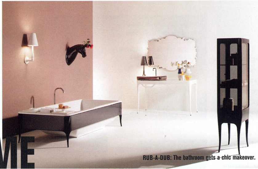
RUB-A-DUB: The bathroom gets a chic makeover.