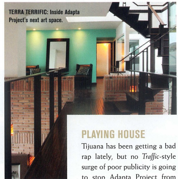
TERRA TERRIFIC: Inside Adapta Project's next art space.